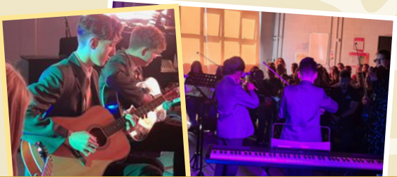
TRINITY MUSIC ACADEMY