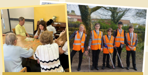
LEADERSHIP IN THE COMMUNITY